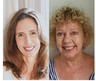
Lucie Paye ; Michèle Roberts