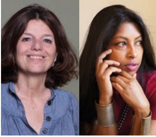
Maylis de Kerangal ; Shumona Sinha