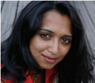
Nathacha Appanah