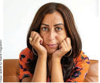
Faiza Guène