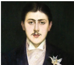
J-E.Blanche, Marcel Proust